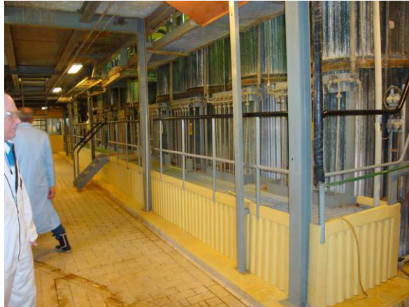
Figure 3.6 Mid section of Percolation Leaching Vessels