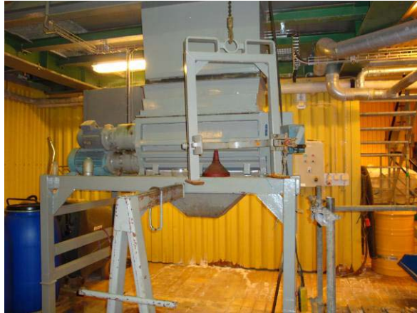
Figure 5.3 Mill for Ashes

Adding in the cost of extra waste disposal could increase this number but the available information makes it difficult to estimate an accurate amount. Even with rather pessimistic assumptions about the ability to decontaminate and allow free release, or disposal to landfill, it is difficult to see how the total cost could increase to more than about SEK 500,000.