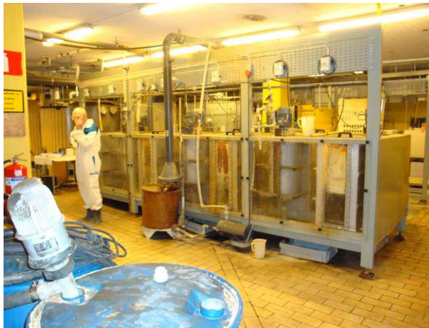
Figure 3.4 Liquid-Liquid Extraction in Mixer-Settlers